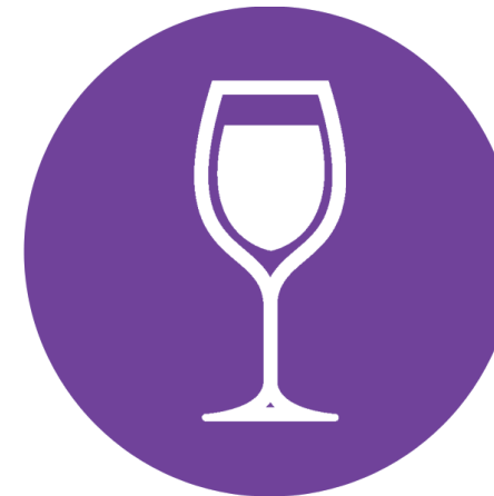
Wine & Whiskey